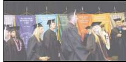
University of the Pacific Class of 2006 graduates walk into the commencement ceremony Saturday at the Alex G. Spanos Center in Stockton