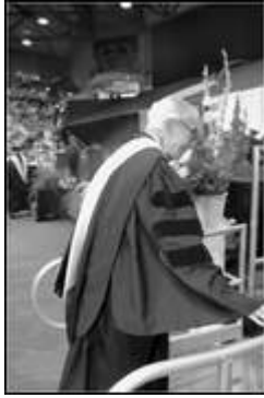
Dave Brubeck received the first President's Medal of Achievement to be awarded in more than a decade at Saturday's commencement ceremony at University of the Pacific